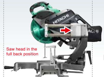
Saw head in the full back position