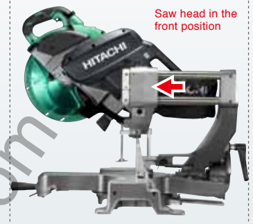
Saw head in the front position

features a fixed rail slide design that eliminates the need for rear clearance to accommodate the extension of the sliding rails. This system allows the saw to sit up against a wall or to be placed in tight work areas without compromising cutting capacity.